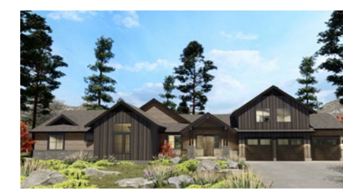
THE ALPINE - A Ridgeline Design